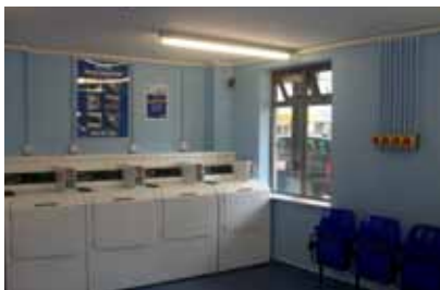
On-site laundry facilities