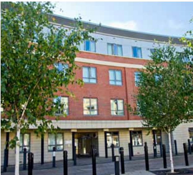
Tripo Court Residence

Living in Tripo Court you'll share a spacious kitchen and walk-through dining and lounge area, which is great for socialising and catching up with friends. In addition to landscaped gardens, Tripo Court features an on-site laundry; access to broadband Internet (there is an additional charge), plus the complex is covered by 24/7 CCTV and swipe-card entry, ensuring peace of mind.