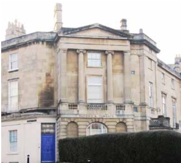
5 George's Place

A £200 deposit is payable by credit card on arrival at the school.