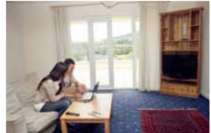
Student lounge area