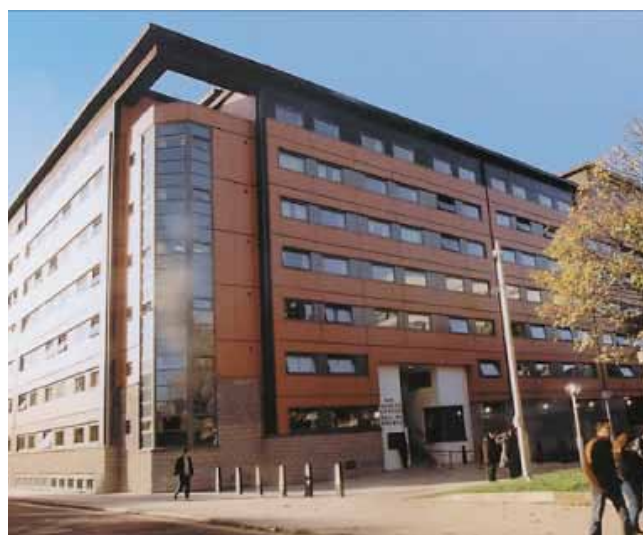
Liberty Living at Sir Charles Grove Hall

Liberty Living Sir Charles Grove Hall Booth Street West Manchester M15 6PF