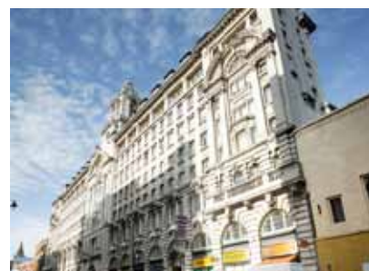
The Kaplan Aspect school - just 10 minutes from the residence