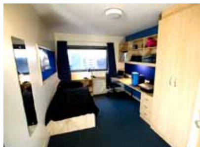
Single study bedroom