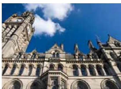
Manchester Cathedral - one of the city's many cultural attractions