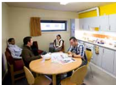
Communal kitchen in 4-bed flat