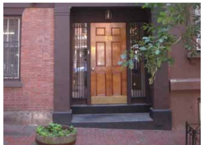
Beacon Hill Apartments Exterior