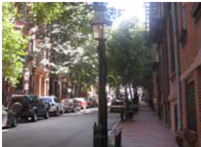
Beacon Hill Street View