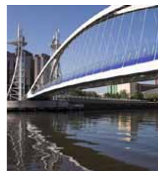
Bridge at Salford Quays