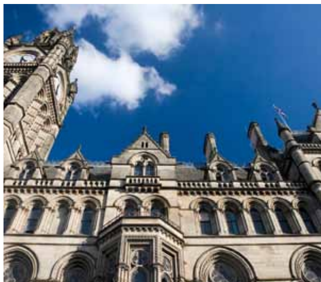
Manchester Town Hall

The Station, Manchester Airport's integrated transport hub, offers fast and frequent train, tram and bus services to the centre of the city. There is a train which goes directly from the airport to Oxford Road, the nearest station to the college.