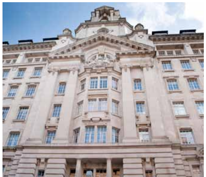
Kaplan International College Manchester

The college is centrally located on Oxford Street, within walking distance of a variety of restaurants, bars and theatres. Facilities include large, well-equipped classrooms, a multimedia centre and a student common room with vending machines and internet access.