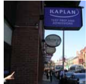
Kaplan international Center Harvard Square Entrance