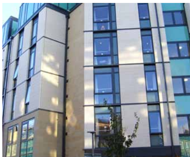
McDonald Road Apartments