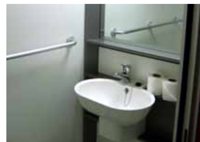
En-suite shower room