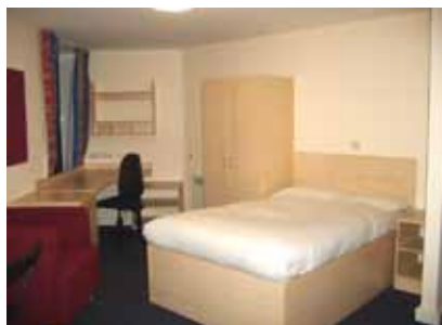
Spacious student bedroom