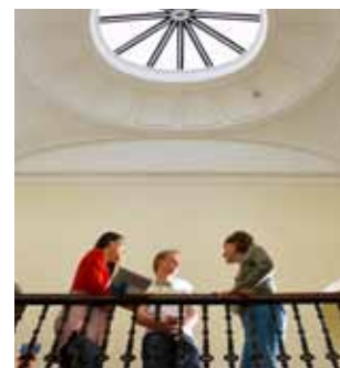
The interior of the college is spacious and bright