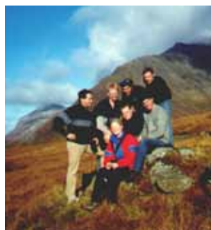
Activities programme includes optional hikes in the magnificent Scottish Highlands