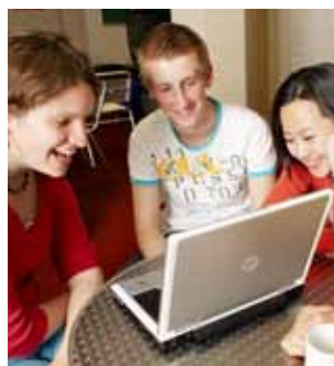
The student common room