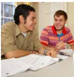
Kaplan students in a classroom

A full and varied social programme is organised each week. Please see overleaf for an example timetable.