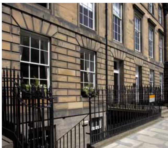
Kaplan International College Edinburgh

The college is in the very heart of Edinburgh, just minutes from the stylish shops of Princes Street and the imposing fortress of Edinburgh Castle. The college is housed in an elegant Georgian building and offers excellent facilities including free wireless Internet connection and a multimedia room with the latest language-learning technology.