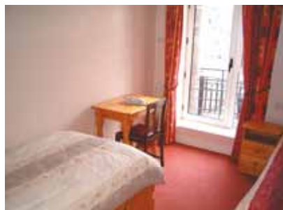
Twin bedroom with study facilities