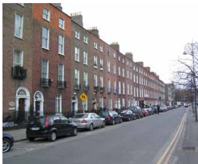
Baggot Street Lower