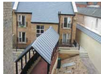
Attractive patio area