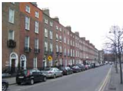
Baggot Street Lower