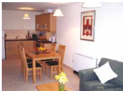
Kitchen and dining room