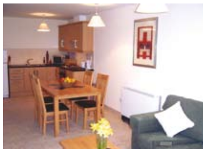
Kitchen and dining room