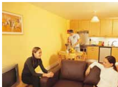
Students enjoying the comfort of their own dining and living room