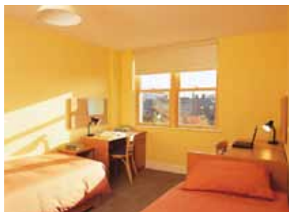
Twin room with study facilities