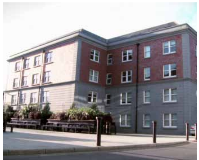
Griffith Halls of Residence

DUBLIN Griffith Halls of Residence Griffith College Campus South Circular Road Dublin 8 Ireland