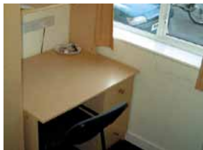
Each bedroom includes a desk and chair for studying