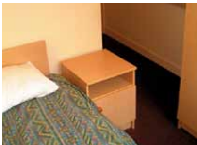
Single study bedroom