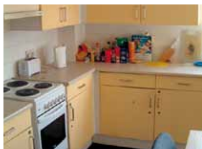
Fully equipped shared kitchen