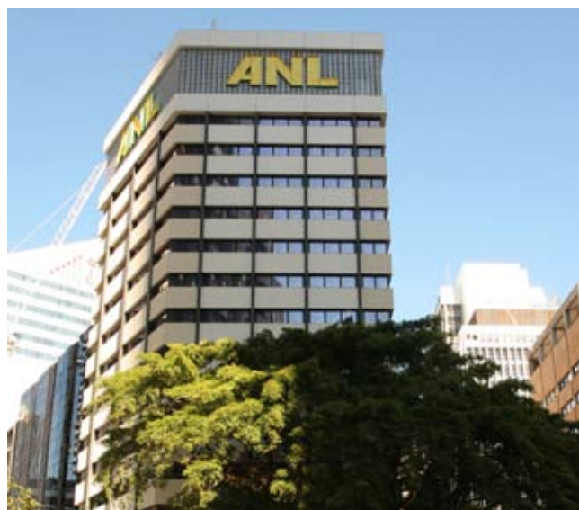
Kaplan Aspect Brisbane