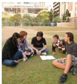
Kaplan Aspect students