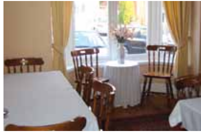
Communal dining room