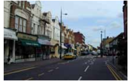
The seaside town of Bournemouth