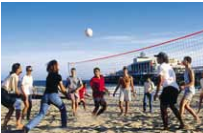
Students enjoying a game of volley ball on Bournemouth beach