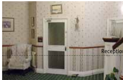
Upton Apartments - Corridor