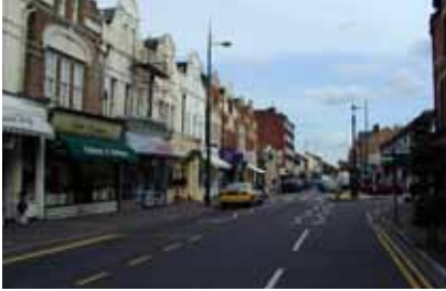
The seaside town of Bournemouth