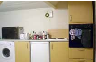
Upton Apartments - Kitchen