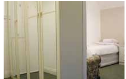
Upton Apartments - Bedroom