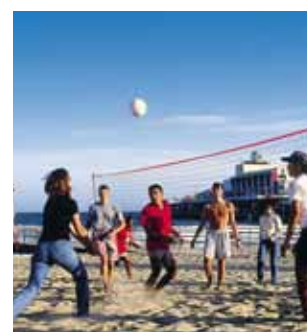
Kaplan students enjoying a game of volley on the beach