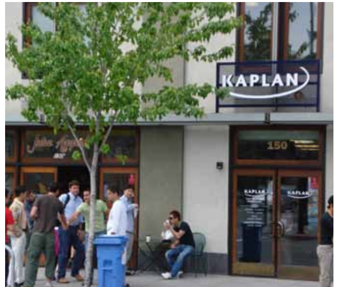
Kaplan Berkeley center

If students use BART, they are advised to take a Dublin Pleasanton Train to the Balboa Park station. Here students should exit and transfer to the Daly City/ Richmond Train, then exit at the Downtown Berkeley Station. From here the Kaplan center is across the street. The ride time is approximately 40-45 minutes.