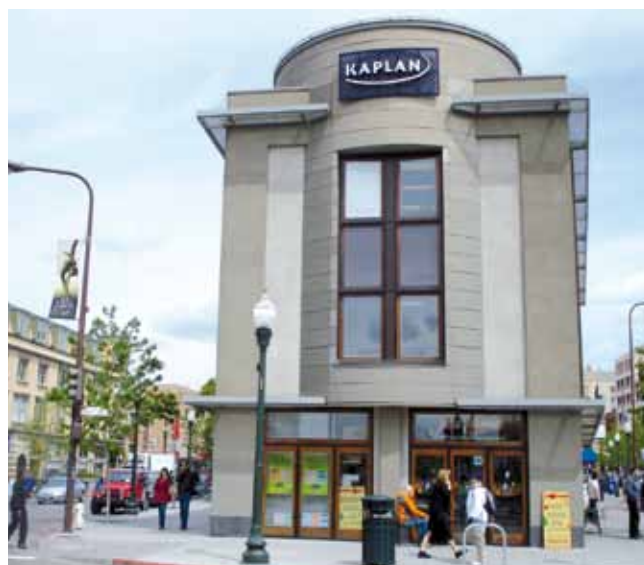
Kaplan Berkeley Center

Kaplan International Centers is a member of AAIEP (American Association of Intensive English Programs), TESOL (Teachers of English to Speakers of Other Languages) and NAESA (Association for International Educators).