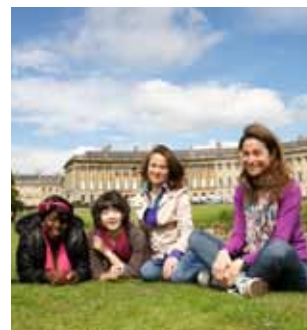
The Royal Crescent