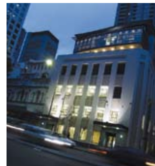
Kaplan Aspect school