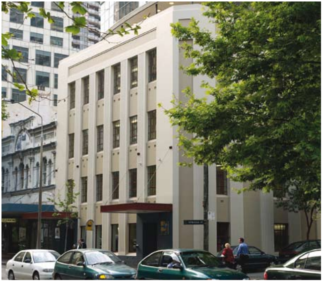
Kaplan Aspect Sydney

For the perfect mix of stunning surroundings, offering beach life, a thriving cultural scene and the excitement of a vibrant metropolis - Sydney is the city to be in. At the end of a day of classes, sit back and drink a cappuccino at a harbour front café and when the weekend arrives, head for Bondi where 'Sydneysiders' soak up the sun and enjoy world-class surfing.